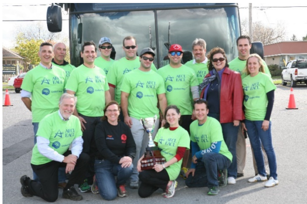
4 th Annual New Flyer Industries Bull Pull Event October 8, 2014 - Arnprior

Officers serving enlisted and civilian personnel