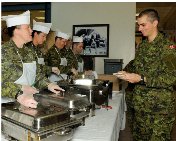
Garrison Petawawa Pancake Breakfast September 26, 2014 – Petawawa