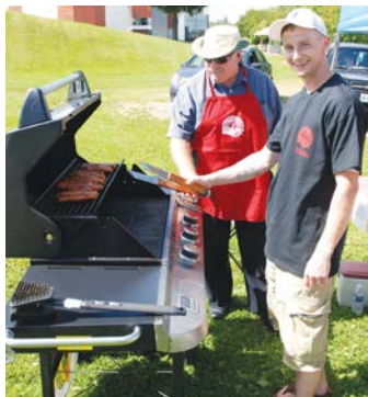
United Way Community BBQ – August 27, 2014 Waterfront Park, Pembroke