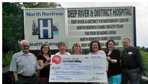
Cheque presentation to North Renfrew Family Services July 8, 2014