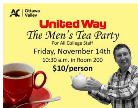
A very successful new event at Algonquin College in 2014!